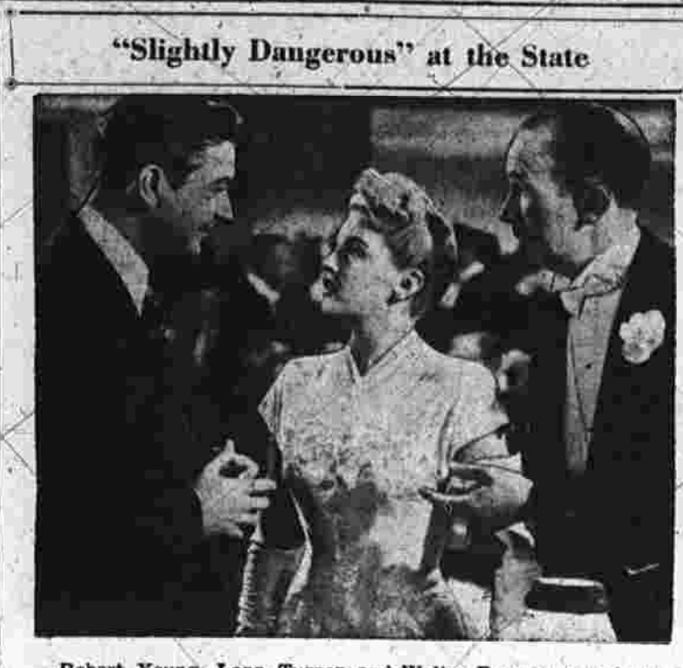
Robert Young, Lana Turner and Walter Brennan are shown in a scene from their latest picture, "Slightly Dangerous," with Dame May Whitty playing at the State Sunday, Monday and Tuesday.